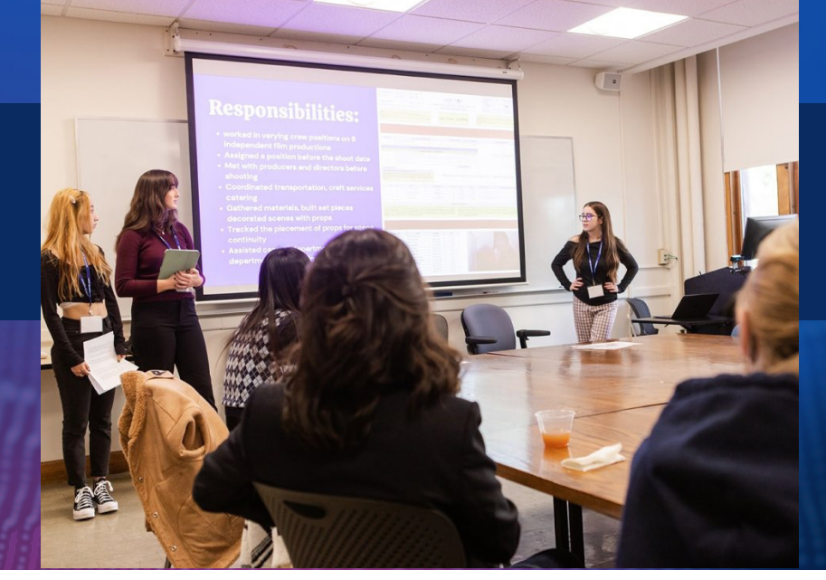
A Mount Holyoke student shares experiences from her Lynk-funded internship with peers.

Case Study: Infusing Workplace Experience Into the Liberal Arts