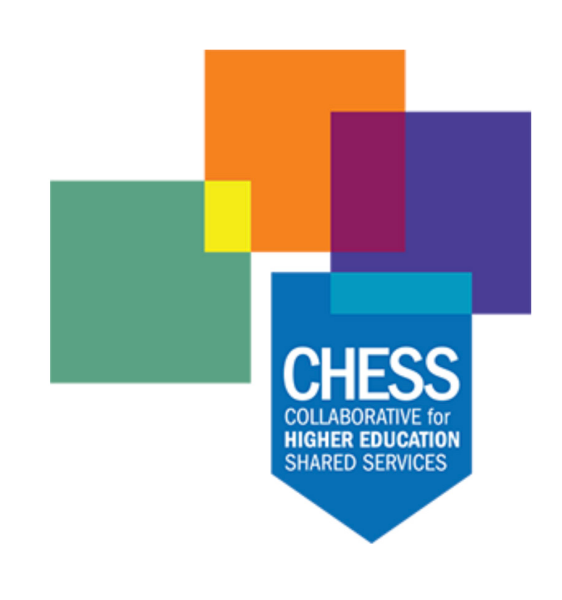
Collaborative for Higher Education Shared Services

Given the enrollment and other challenges they face, a group of previously independent community colleges in New Mexico have decided they're stronger working together on key problems than toiling apart.