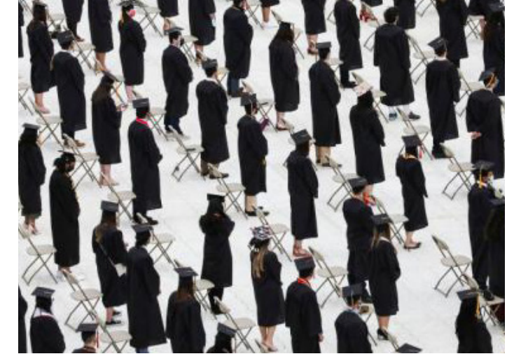
Soon-to-be graduates from Northeastern University attend commencement.