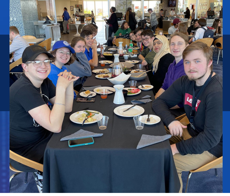
Participants in the BlueSky Tennessee Institute program

Case Study: Working With Employers to Train Future Leaders