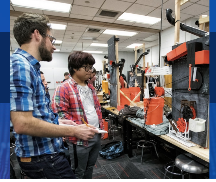
Mechanical engineering students at Utah Tech

Case Study: Expanding Credentials to Meet Learners' Many Needs